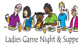
Ladies Game Night & Supper

The GMC Annual Meeting will be immediately following the morning service on January 26, 2025. If you are a member, please stay for this important meeting.